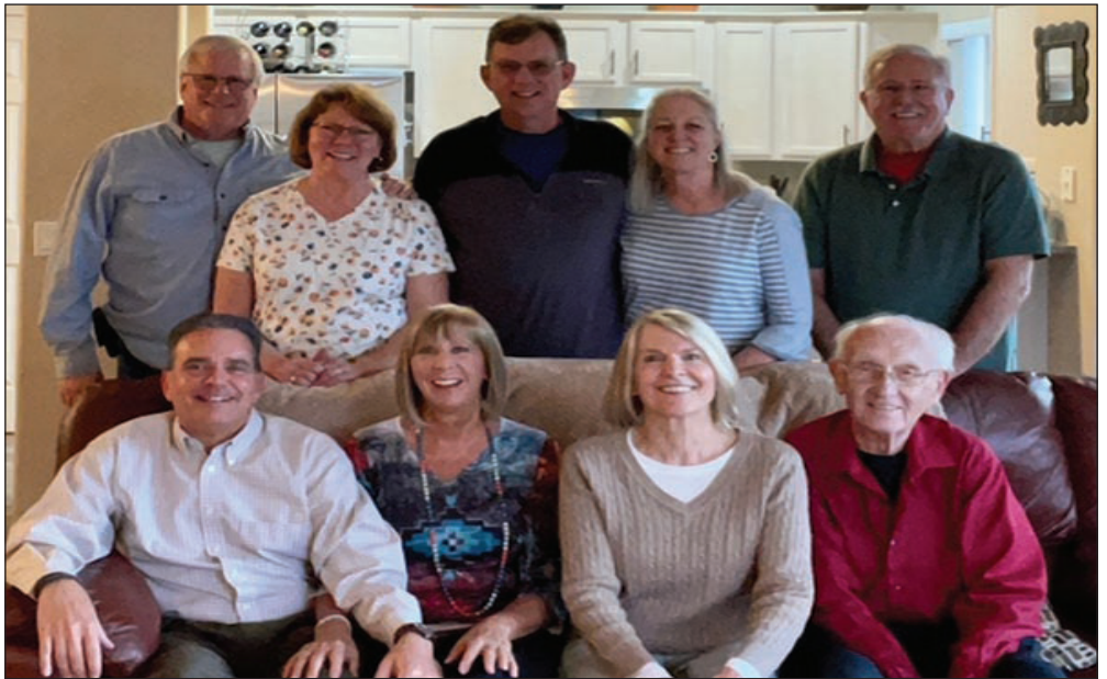
The Log Church 2023 Arizona Congregation