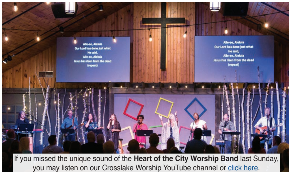
If you missed the unique sound of the Heart of the City Worship Band last Sunday, you may listen on our Crosslake Worship YouTube channel or click here.

As iron sharpens iron so one person sharpens another." Thank you young one, for sharpening me. God is there, in every part of your story. Do you see him?