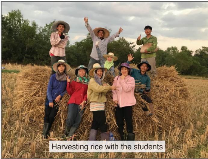
Harvesting rice with the students